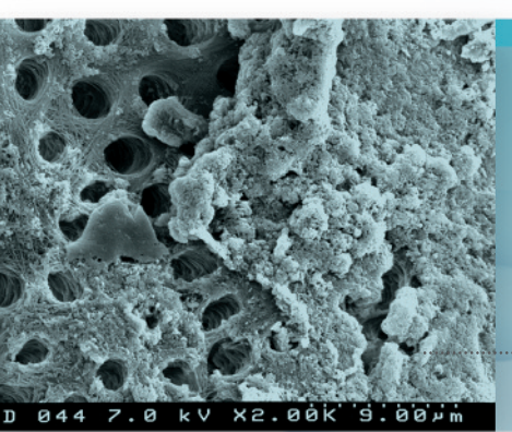
Canal walls free of smear layer due to EDTA and its softening effect

Using EDTA, a chelating (demineralising) agent, clean canal walls, completely free of smear layer are obtained and calcified canals are easier to shape.